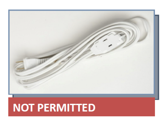
Damaged cords are not Permitted