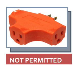
Adapters (2 or 3 prong ) are not permitted

Two (2) prong extension cords are NOT permitted